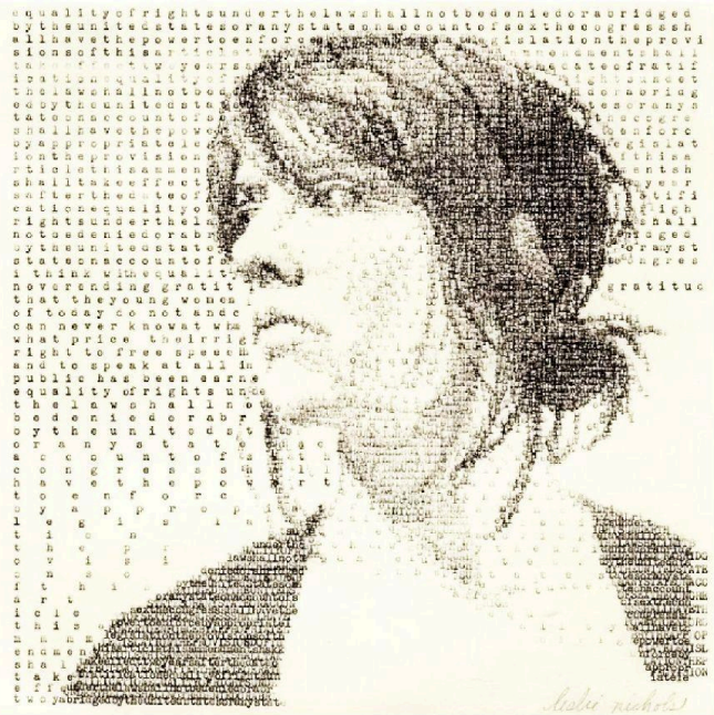
'Looking Forward' by Leslie Nichols (2010)

Exercise : Create an imagery of a ball with light and shade using just one letter as the repetitive element